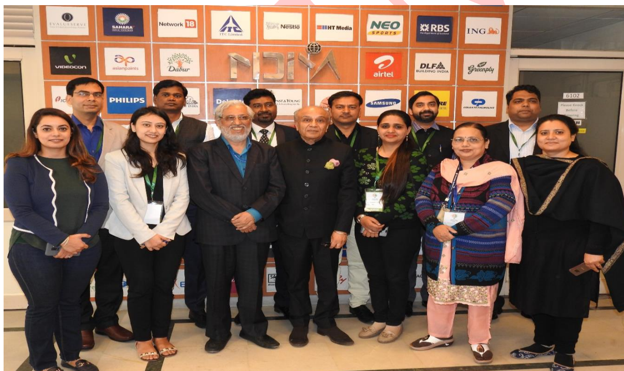
Tribute to Soldiers from NDIM Students